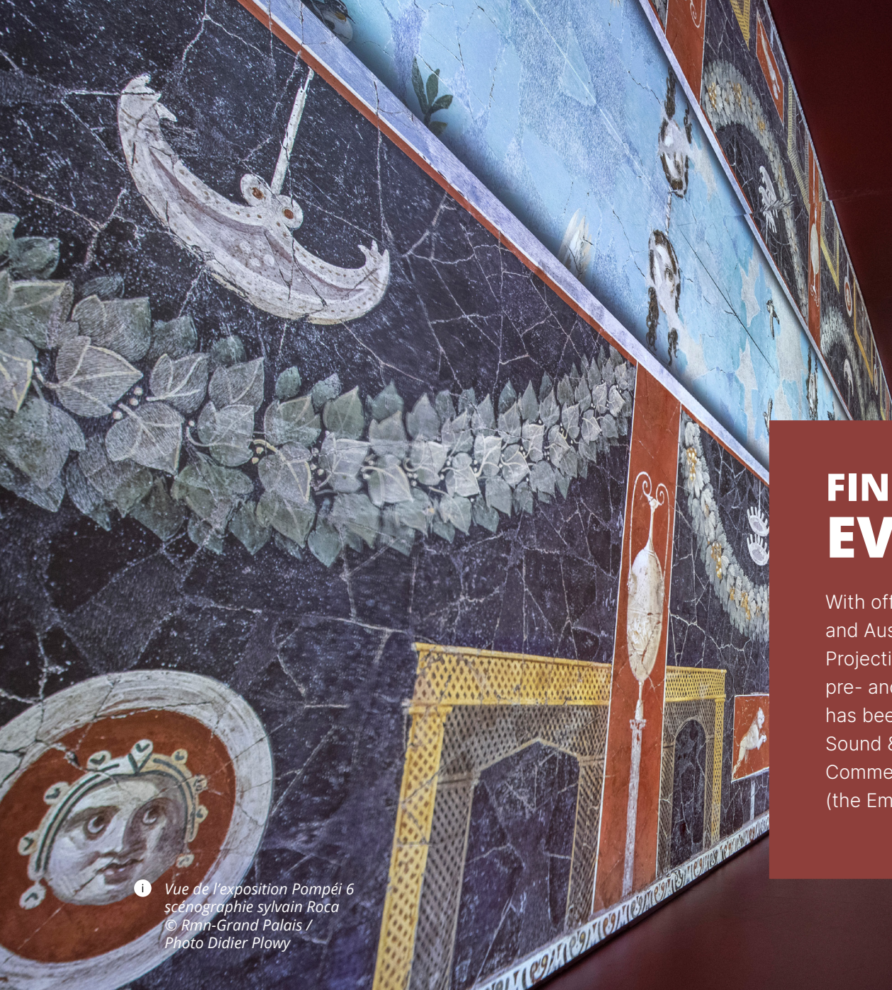
i Vue de l'exposition Pompéi 6 scénographie sylvain Roca